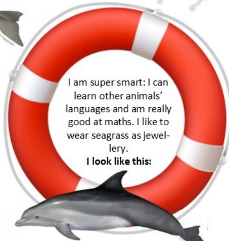
Bottlenose dolphin, 4 m

I live in huge groups called pods with up to 1000 dolphins. We are more active during the night and rest during the day.