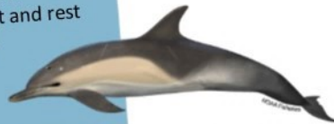
Common dolphin, 2 m

I am the best diver because I can hold my breath for up to two hours. I can also pull my fins into pockets at my side which helps me to dive faster.