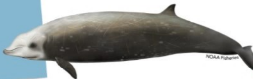
Cuvier's beaked whale, 6 m

My lifestyle is fast and furious . I am super fast, can jump more than three times my length, up to 9 m, and like to perform acrobatics.