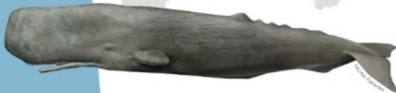
Sperm whale, 18 m

I have the biggest brain. And each tooth in my lower jaw weighs 1kg. I am huge!