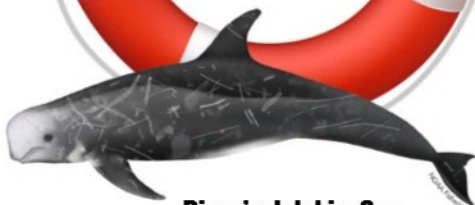
Risso's dolphin, 6 m

I am super smart: I can learn other animals' languages and am really good at maths. I like to wear seagrass as jewellery.