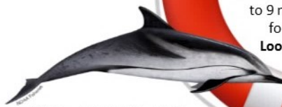
Striped dolphin, 2,5 m